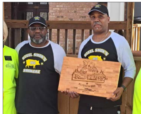
2nd Place Professional– Tailgaters BBQ