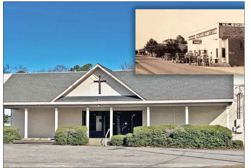
The former Wilson's store.