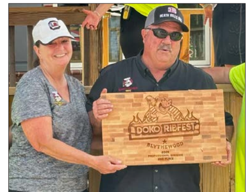
3rd Place Professional – Still Smokin' Smokers