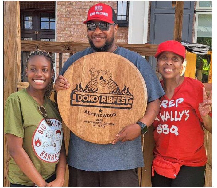
1st Place Professional Division – Big Wally's