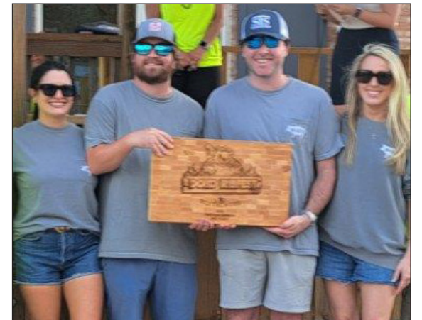
3rd Place Amateur– Bo Boys BBQ