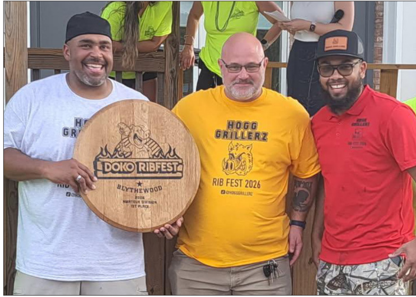
1st Place Amateur Division – Hog Callers