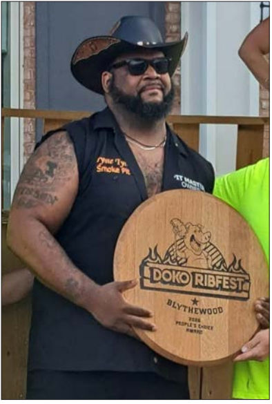
People's Choice Winner Prime Time Smokers