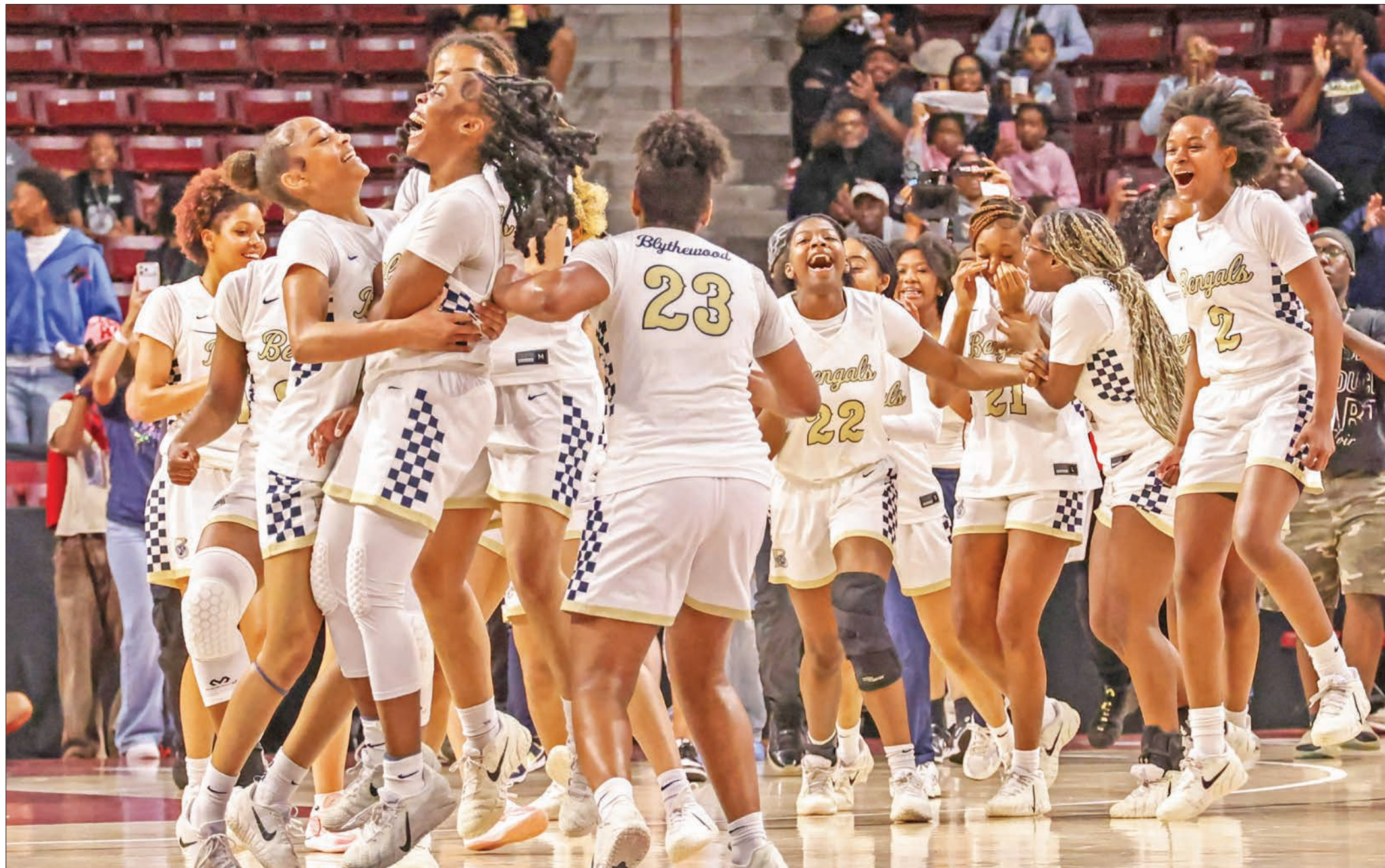
Blythewood celebrates their State Championship win on Friday. The program went from 0-19 in 2022 to their second straight State Title.